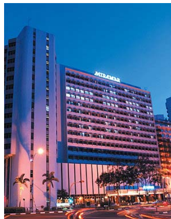
The Miramar Hotel