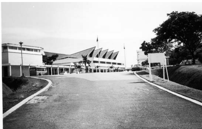
Remember the old view? I wonder if it's still there?

We are looking at the Hotel Miramar in Havelock Road . It is mid-price to suit everyone and has a restaurant, bar, coffee shop, 24 hour room service, pool and fitness centre. There’s also an MRT (underground railway) station nearby.